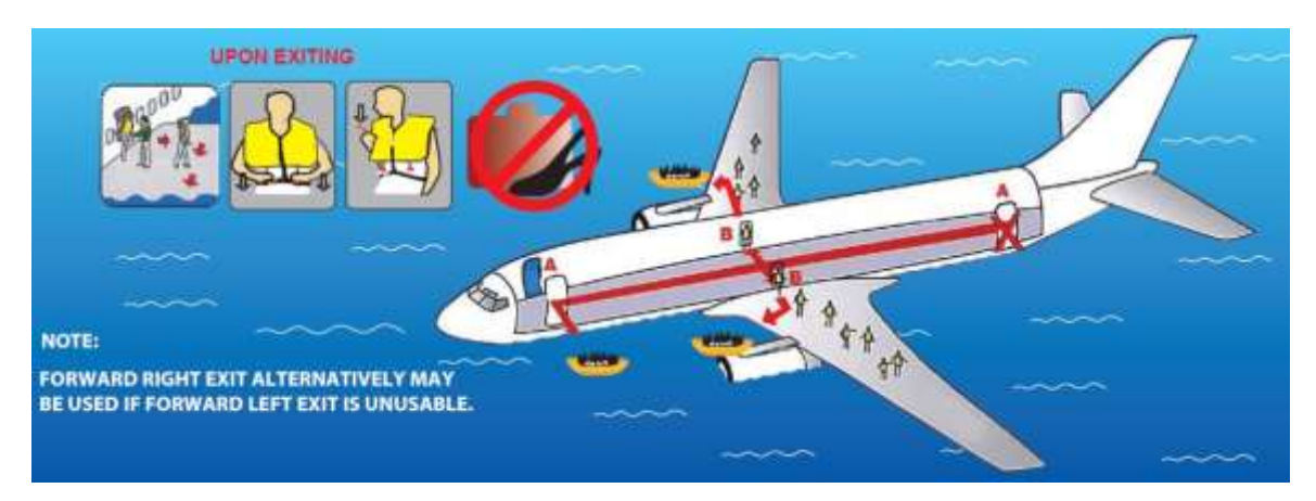
Figure 3: Boeing 737-800 Safety on Board card (Version PX3-11001 Rev.D)