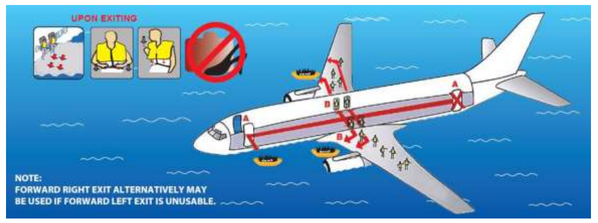
Figure 2: Boeing 737-800 Safety on Board card (Version PX3-11009 Rev.B)

Air Niugini Limited informed the PNG AIC that the new Safety on Board cards will be in the aircraft on Wednesday 5 December 2018.