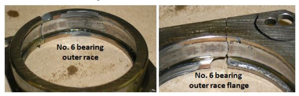
Figure 3: No 6 bearing outer race

The manufacturer concluded that the engine No. 1 power section lost useful power due to the disintegration of the combining gearbox left hand 1<sup>st</sup> stage gear input shaft roller bearing (No. 6 Bearing), which allowed radial movement and vibration of the left hand 1<sup>st</sup> stage gear and disengagement with its mating idler gear. This unloaded the No. 1 Power section power turbine drive train, allowing the power turbine to accelerate to an overspeed condition and release the power turbine blades, with resultant damage to the adjacent and drive train components. One No. 6 bearing outer race retaining bolt locking key washer was not in place, which resulted in loosening of the bolt with subsequent vibration and eccentric loading leading to fracture of the inner race and liberation of the rolling elements. The No. 6 bearing is accessed only at overhaul or major repair. The facility conducting the last overhaul of the combining gearbox could not be determined from records forwarded with the engine.