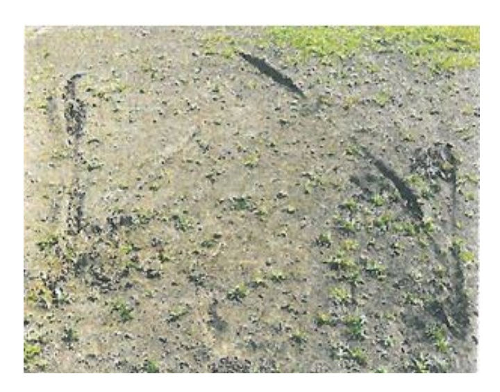
Figure 2: Heavy landing imprint made by landing gear skids

After the heavy landing all thirteen passengers evacuated the helicopter to a safe distance away and were rescued by another helicopter to continue their journey as planned. None of the occupants were injured.