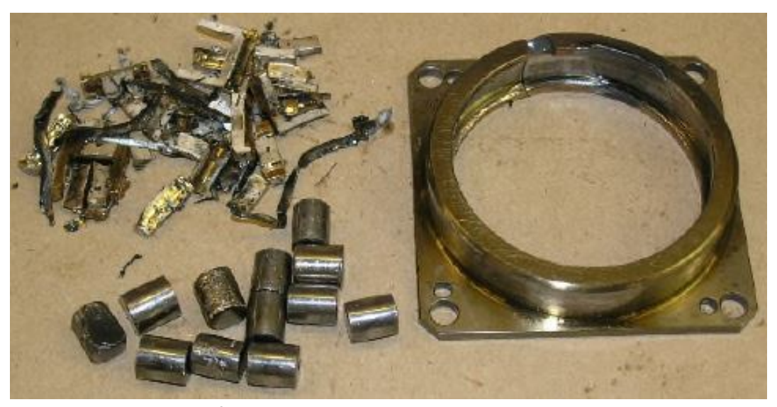
Figure 4: No. 6 bearing showing failed components