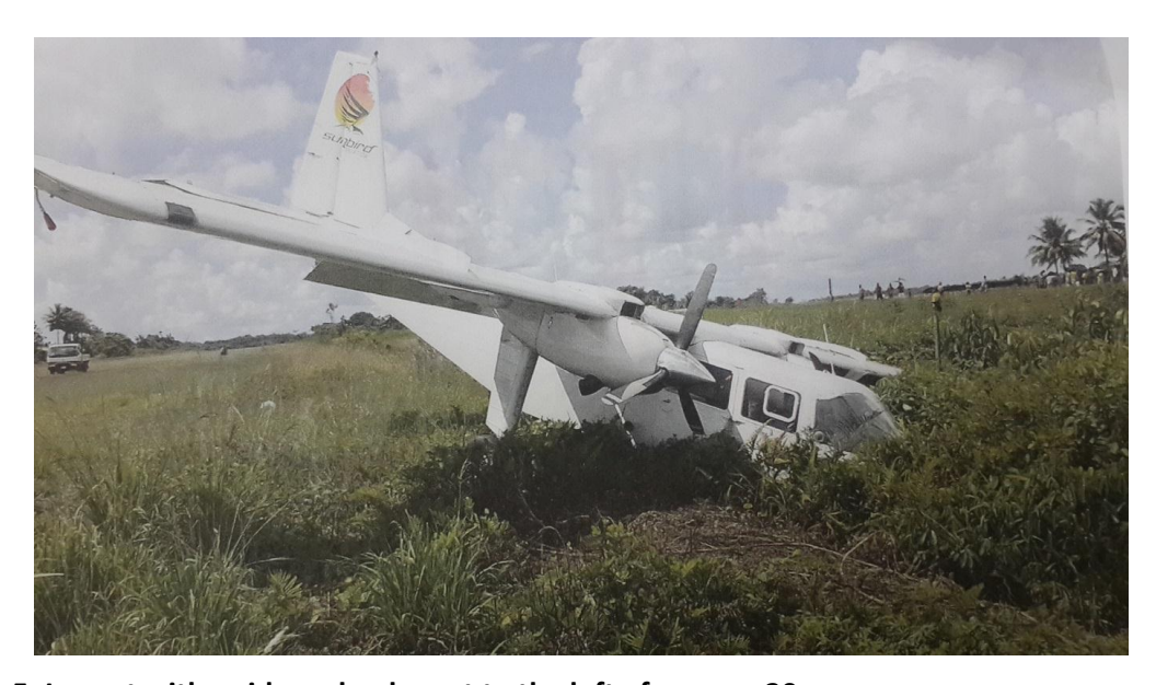
Figure 5: Impact with a side embankment to the left of runway 30

As the aircraft approached the mid-point of the runway, he applied braking pressure after lowering the nose wheel to the ground. At approximately abeam the taxiway to the parking bay, the aircraft veered left and ran off the runway (See Figs 3 and 5). The pilot stated that, although he applied even brake pedal pressure (on the left and right brakes), he experienced differential braking which caused the aircraft to veer to the left. He also said that he steered to the left to avoid running off the end of the runway. The aircraft subsequently impacted an embankment beyond the left side of the runway, approximately 70 metres from the runway end (Fig. 5).