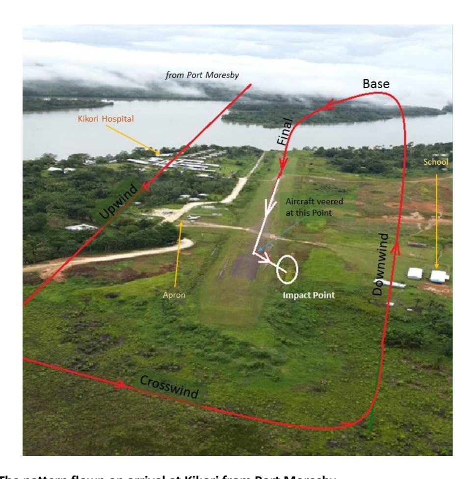
Figure 3: The pattern flown on arrival at Kikori from Port Moresby