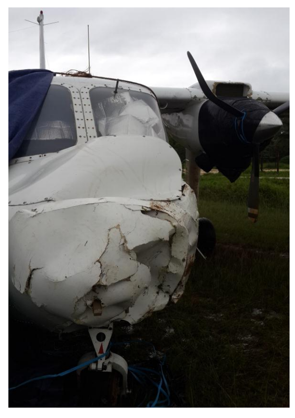
Figure 6: Damage to front of aircraft and the nose landing gear assembly

The nose of the aircraft was crushed and the nose landing gear partially collapsed rearwards during the impact with the embankment (Fig. 6). Two of the left propeller blades were bent.