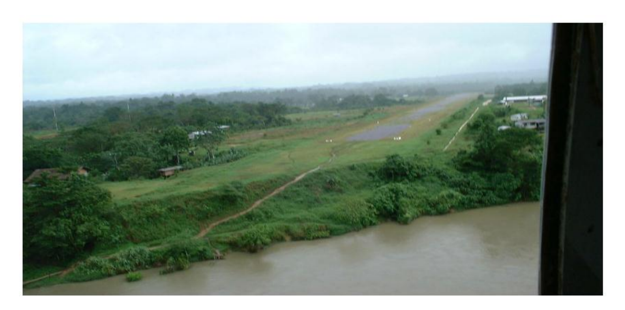
Figure 4: Kikori viewed from the runway 30 approach end

As the aircraft approached the mid-point of the runway, he applied braking pressure after lowering the nose wheel to the ground. At approximately abeam the taxiway to the parking bay, the aircraft veered left and ran off the runway (See Figs 3 and 5). The pilot stated that, although he applied even brake pedal pressure (on the left and right brakes), he experienced differential braking which caused the aircraft to veer to the left. He also said that he steered to the left to avoid running off the end of the runway. The aircraft subsequently impacted an embankment beyond the left side of the runway, approximately 70 metres from the runway end (Fig. 5).