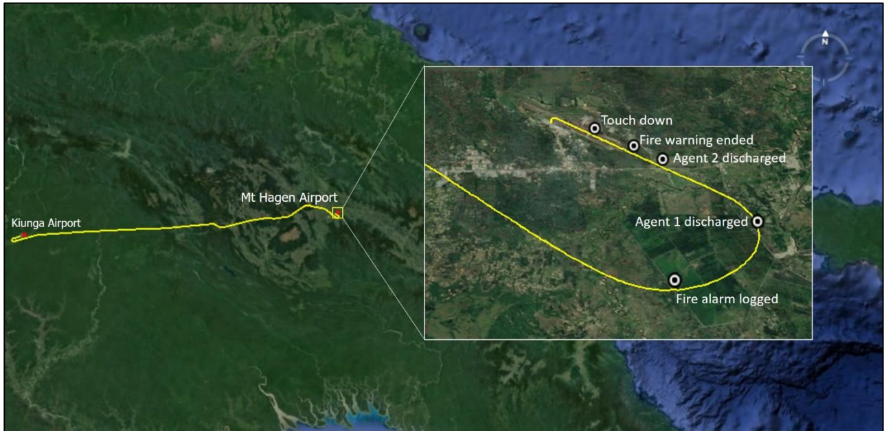
Figure 1: P2-ATB depiction of flight path.

On 23 December 2020, at 13:52 local (03:52 UTC 1 ), an ATR 72 – 212A aircraft, registered P2-ATB, operated by PNG Air Limited, on a scheduled passenger flight from Kiunga Airport, Western Province to Mount Hagen Airport, Western Highlands Province, had a No. 2 engine (right-hand) fire warning activation, during base turn at the destination airport circuit area.