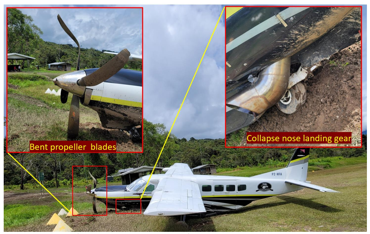
Figure 3. Overview of damage sustained to the aircraft.