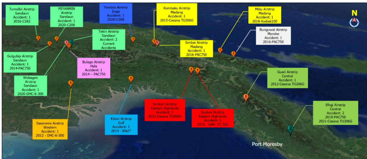
Figure 2: Accidents at rural airstrips and the geological locations of the airstrips

The AIC found that with an average of about two accidents per year, it has been an aviation safety concern for the travelling public into rural airstrips.