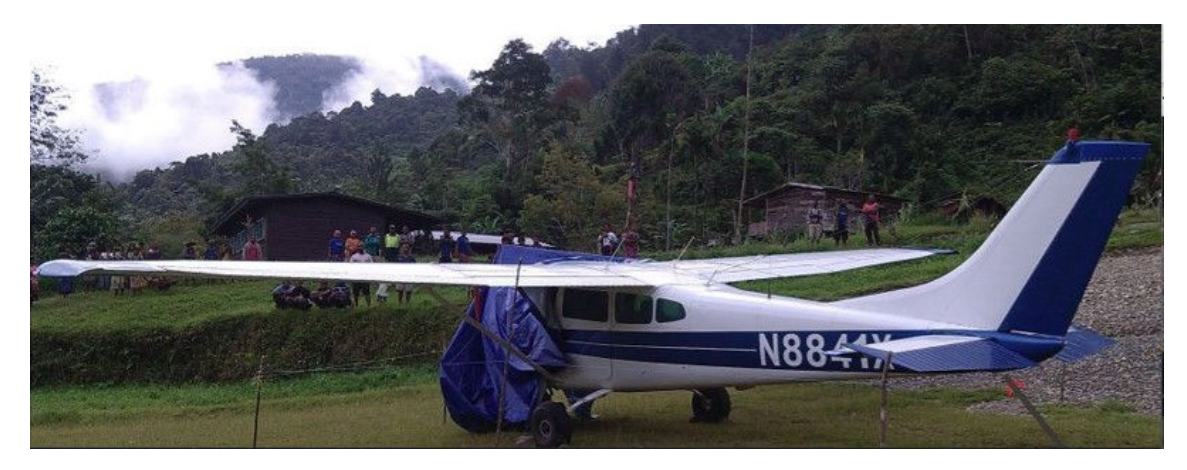
Figure 3: Aircraft at Tumolbil after accident

The Tumolbil airstrip, oriented 14/32 (140°M/320°M), is a one-way grass strip 3,367 feet AMSL<sup>3</sup> and surrounded by high mountainous, densely vegetated terrain. The airstrip slope is 12% down to the northwest. As published in the PNG AIP<sup>4</sup>, the Tumolbil airstrip is administered by the Sepik Baptiste Inc.