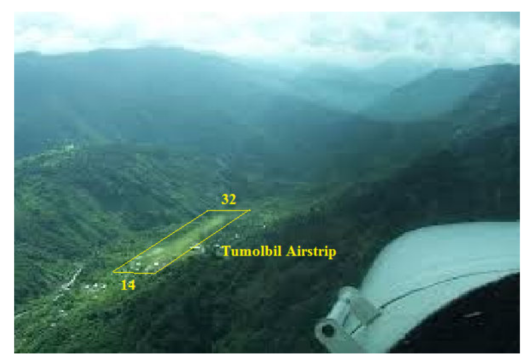
Figure 2: Aerial view of the Tumolbil Airstrip

Tumolbil ( 04^{\circ} 46.360 S / 141° 00.713 E) is located about 10 nm (18.8 km) south-west of Yapsie, and 32 nm (59 km) north-west of Tabubil. It is 0.85 nm (1.65 km) east of the PNG-Indonesia border, in a very remote part of the West Sepik province (Figure 1). There are no roads leading to the area or to any adjacent neighbouring villages. The only way in and out of the area is by air.