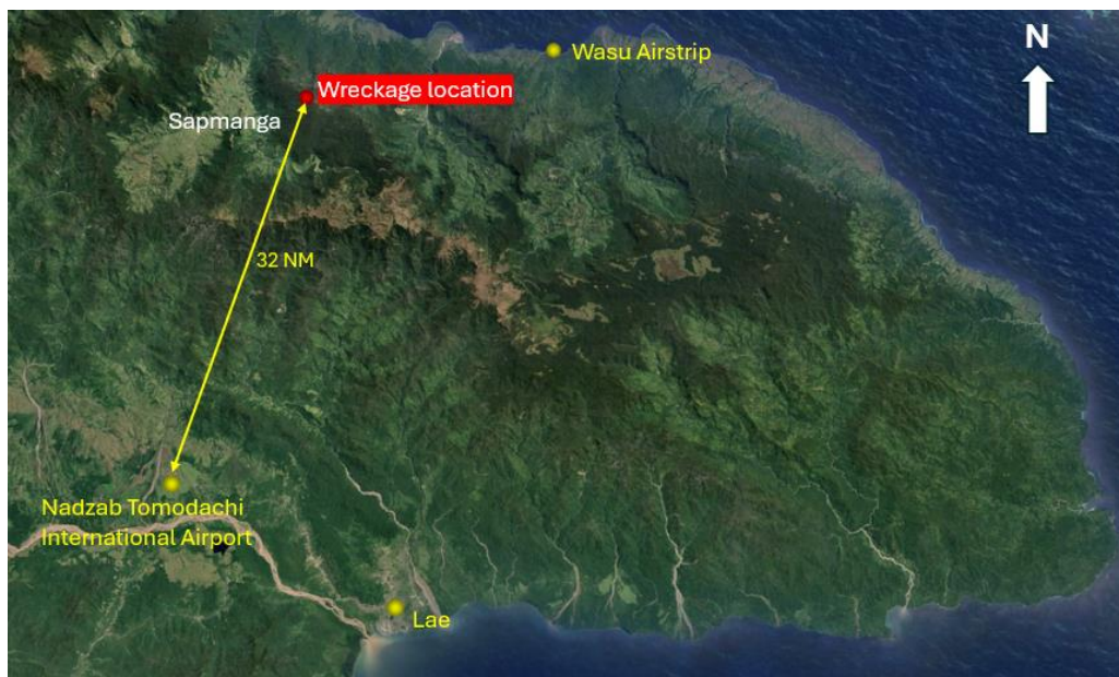
Figure 2: Depiction of the wreckage location in reference to Nadzab Tomodachi International Airport, Morobe Province.